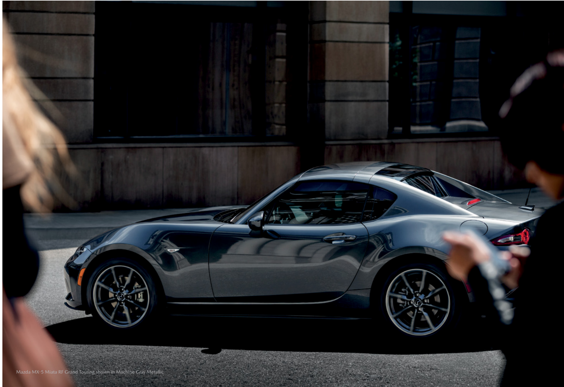
Mazda MX-5 Miata RF Grand Touring shown in Machine Gray Metallic