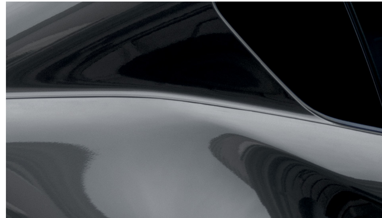
From left to right: Soul Red Crystal Metallic, Machine Gray Metallic