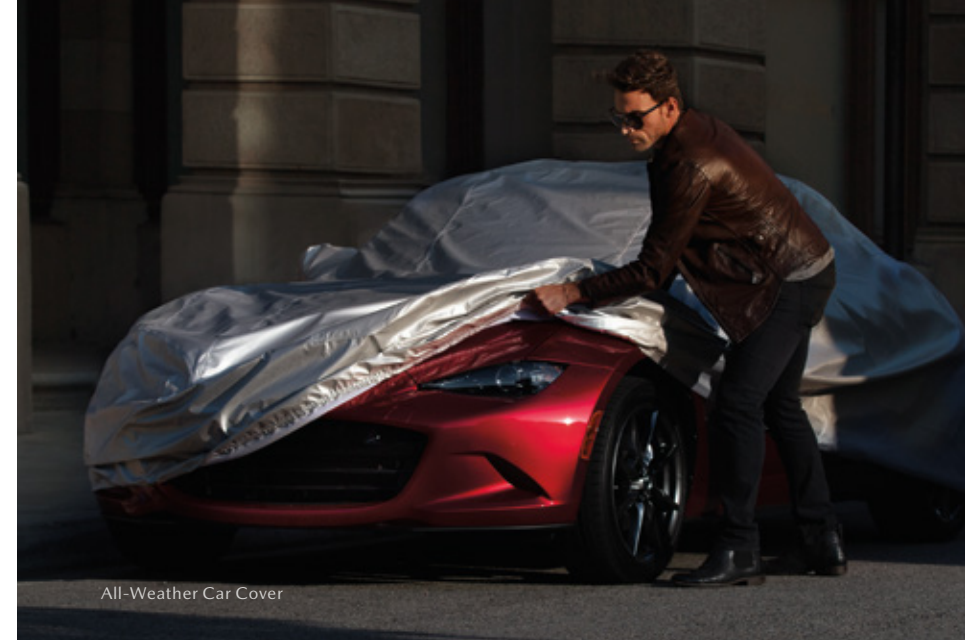
All-Weather Car Cover

Mazda has created thoughtfully designed accessories that perform seamlessly with your Mazda MX-5 Miata, enhancing and further personalizing your driving experience. When installed by your Mazda Dealer, Genuine Mazda Accessories carry the same New Vehicle Limited Warranty as your new Mazda. For a full list of Genuine Mazda Accessories for your Mazda MX-5 Miata, visit Accessories.MazdaUSA.com .