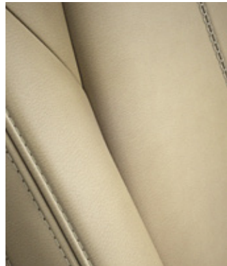
Sport Tan Leather Grand Touring