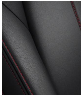
Black Leather with Red Accent Stitching Grand Touring