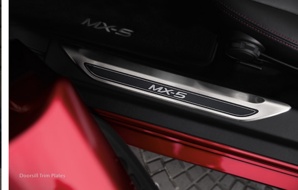
Door Sill Trim Plates