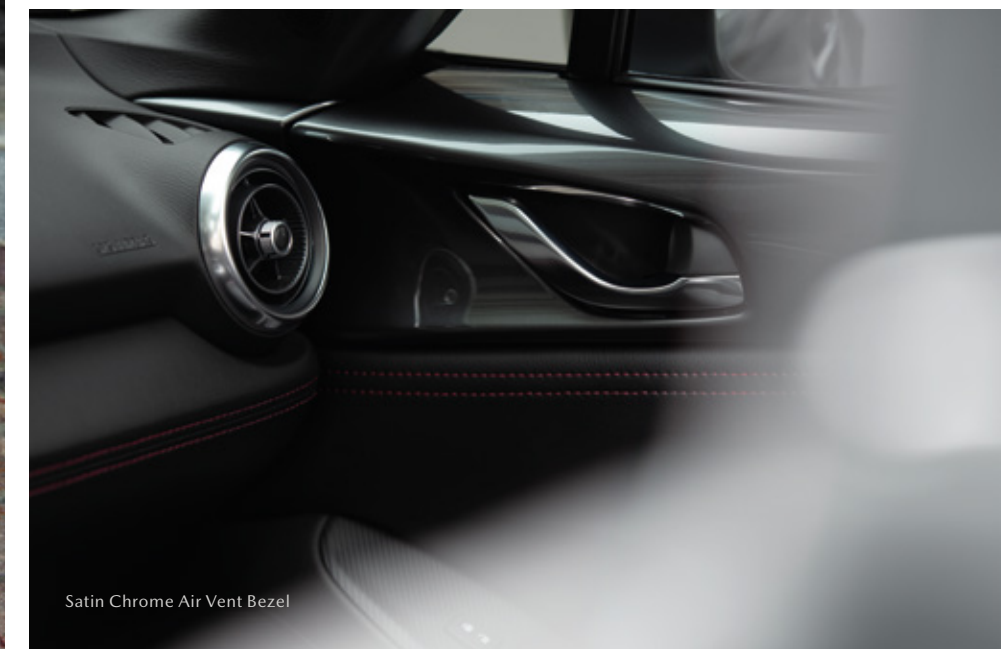
Satin Chrome Air Vent Bezel