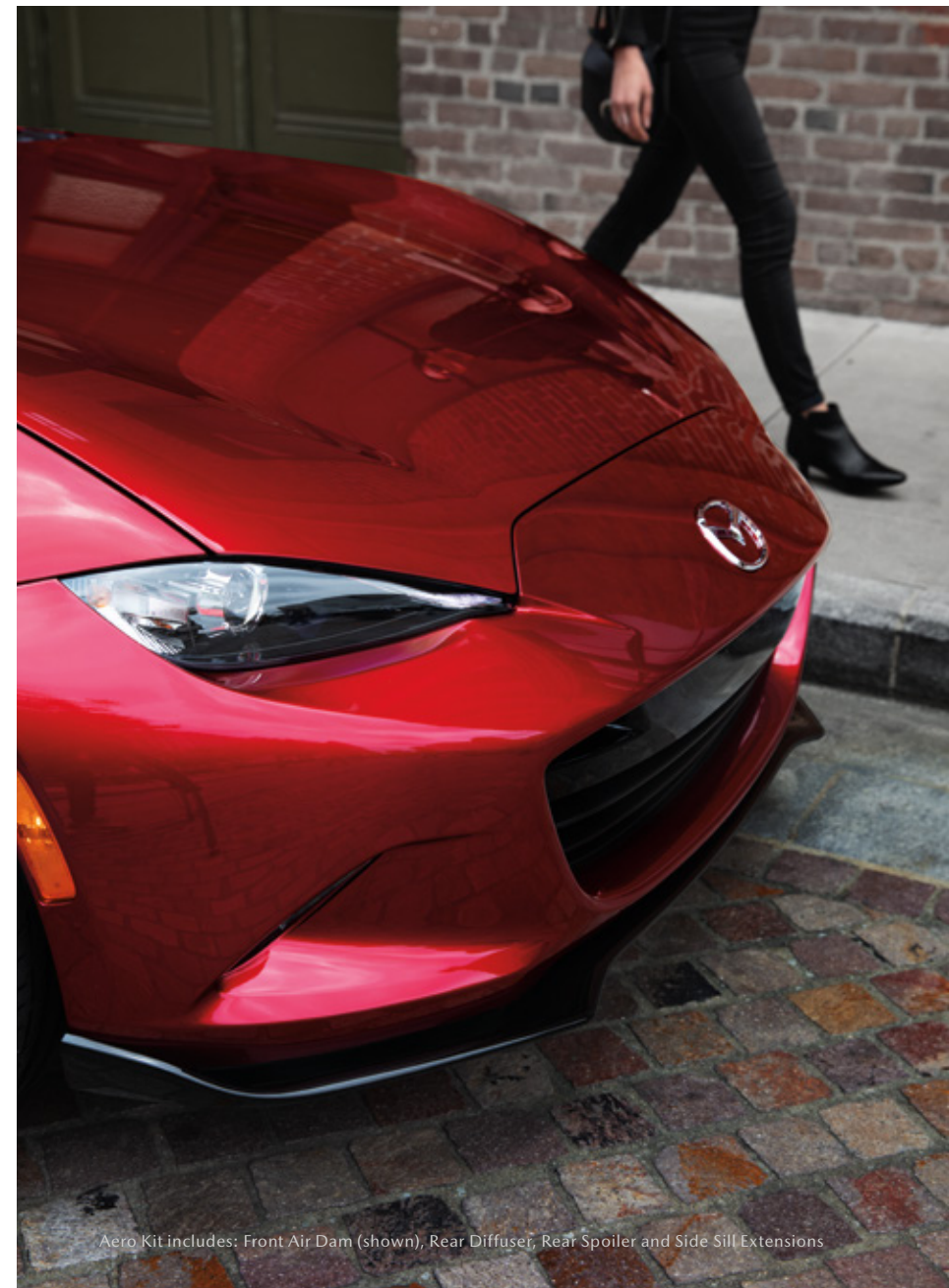
Aero Kit includes: Front Air Dam (shown), Rear Diffuser, Rear Spoiler and Side Sill Extensions