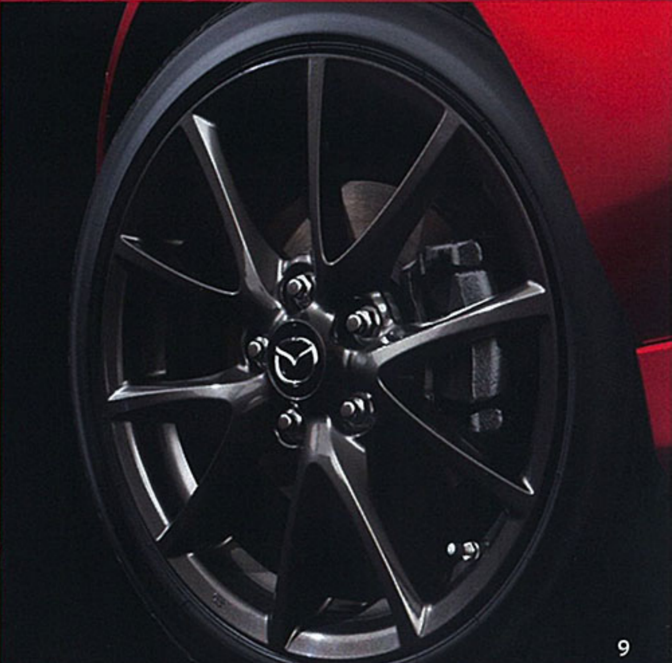
1 The lavish interior is testament to the uncompromising skills and techniques developed according to Mazda's TAKUMI (master craftsman) concept. Headrests embossed with the 25th Anniversary logo, and red contrast-stitching on the leather seats, floor console lid, manual shift lever boot, parking brake handle and door armrests are just some of the interior's highlights. 2 Satin-chrome meter rings. 3 Steering wheel with contrast-stitch cover and piano-black spokes. 4 25th Anniversary badge with serial number. 5 Stainless steel scuff plate with 25th Anniversary logo. 6 Hand-painted red decoration panel reflects subtle gradations of light. 7 Brilliant Black door mirrors, A-pillars and seatback bars combine with the Brilliant Black retractable hard top and headlamp bezels to create a taut, unified harmony in black. 8 17-inch aluminum wheels with gunmetal finish.