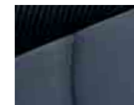
BLACK CLOTH MX-5 Miata