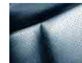
BLACK LEATHER MX-5 Miata LS